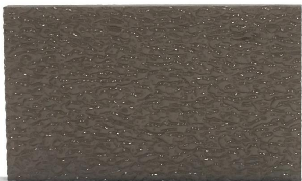
Emboss Metallic Bronze